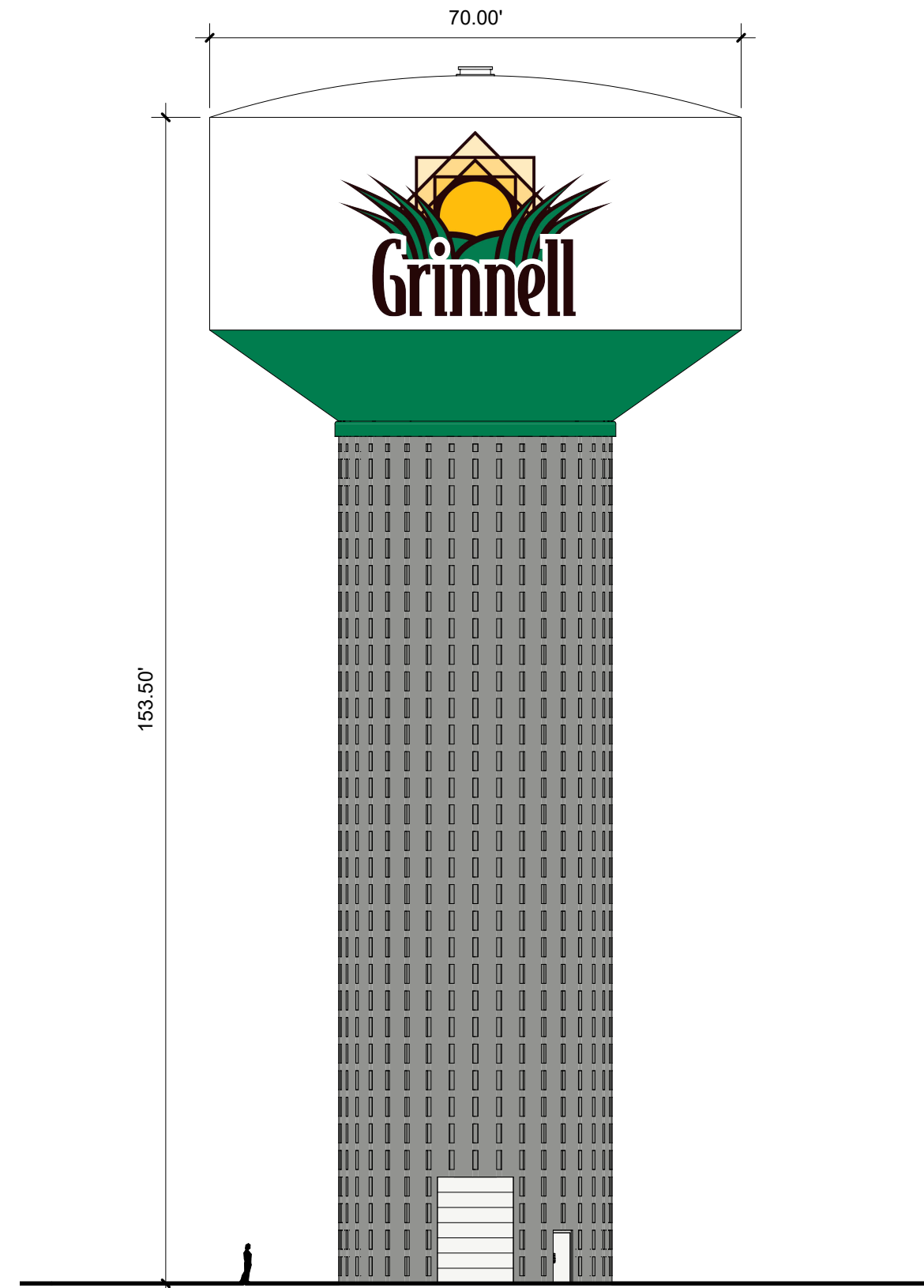
TANK LOGO OPTION 2 1.0 MG COMPOSITE

Paint Scheme - White/Green Bowl South Water Tower - Grinnell, Iowa